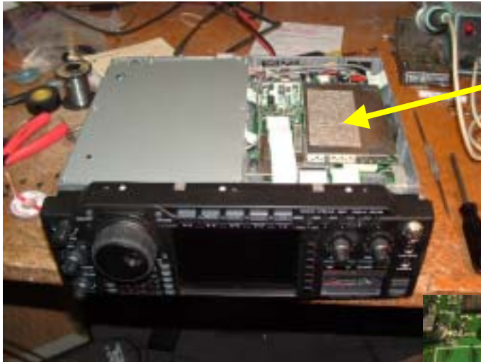
Picture 1. DSP unit. Unplug and set aside.

Observe control unit on right side with plug-in DSP unit. Carefully unplug DSP unit and set aside (see orientation picture 1.)